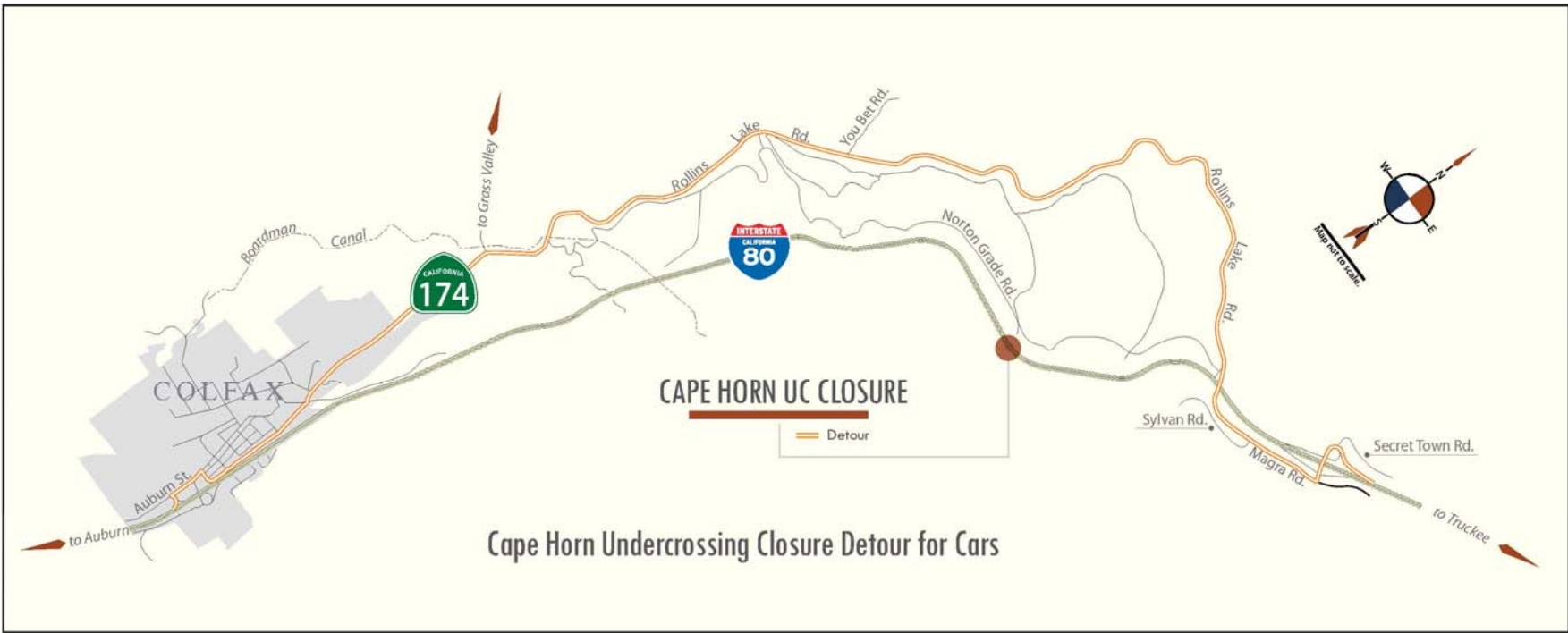
Detour on Rollins Lake Road to Highway 174 to Colfax and I-80 – 7 miles