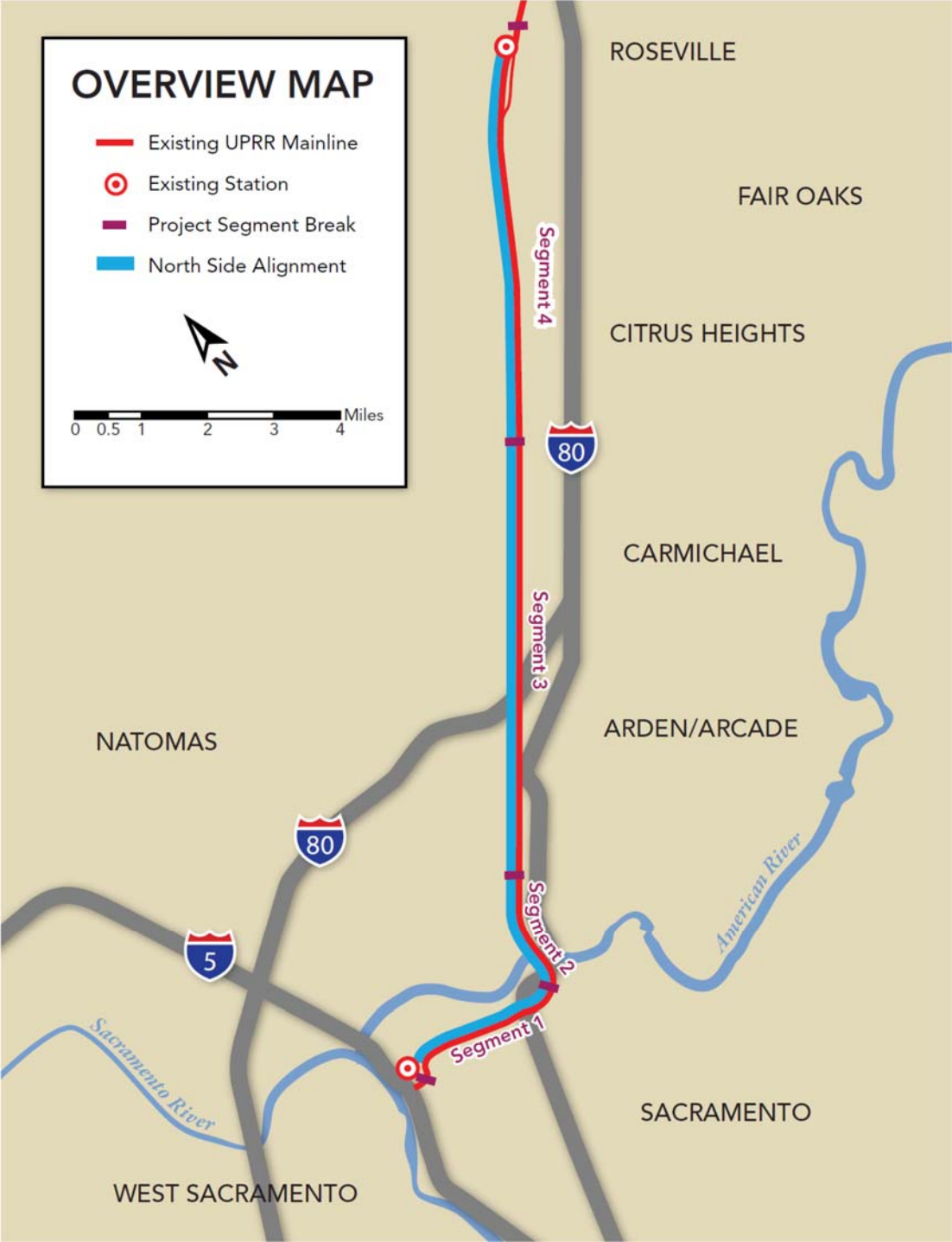
Exhibit 1: Project Location of Third Track